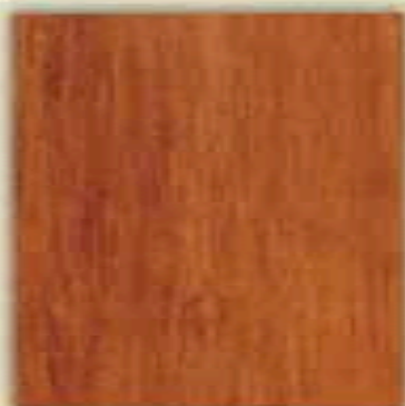
Coffee color (EB-C06)