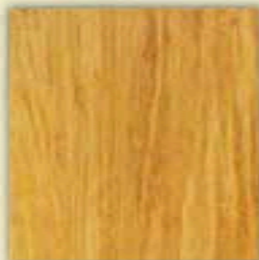
Natural color (EB-N01)