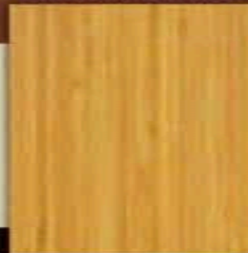
Vertical Natural (V-NSAC-SG)