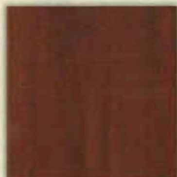
Espresso color (EB-E26)