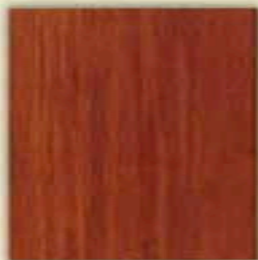
Mocha color (EB-M13)

Bamboo engineered with HDF board Size: 48" x 4.5" x 5/8" per plank