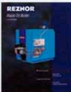
Waste Oil Boilers RZ-B-WOB

For More Information Call 1-800-695-1901, Press 2