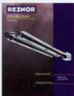
Infrared, Hydronic & Electric Heaters RZ-B-HRE

(See these brochures for info on other products)